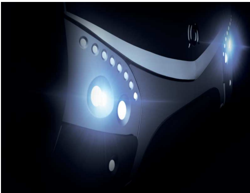
NS 12 diesel