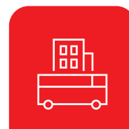
NS 18 diesel